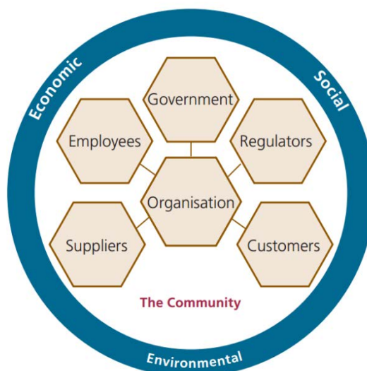
Organisations and their Stakeholders